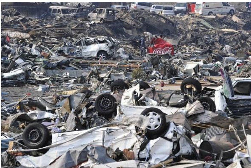
Aftermath of the Tohoku earthquake and tsunami, Japan, March 2011

A magnitude 7.5 earthquake is big and devastating, the magnitude being on the Richter scale, which has been in use since the 1930s to measure the amplitude of seismic waves (ie the amount of shaking). The highest magnitude is about 9, with the 2004 Sumatra earthquake at M9.1 and the 2011 Japan earthquake at M9.0 in recent years. It is a logarithmic scale with the amount of shaking increasing tenfold with each unit increase while the energy increases 30-fold. The effects of an earthquake depend on its depth, the geology and how far away it is. Earthquakes happen when rocks stick along a fault line until the pressure exceeds the friction, when the rock ruptures suddenly at 2km/second – this is stick – slip motion.