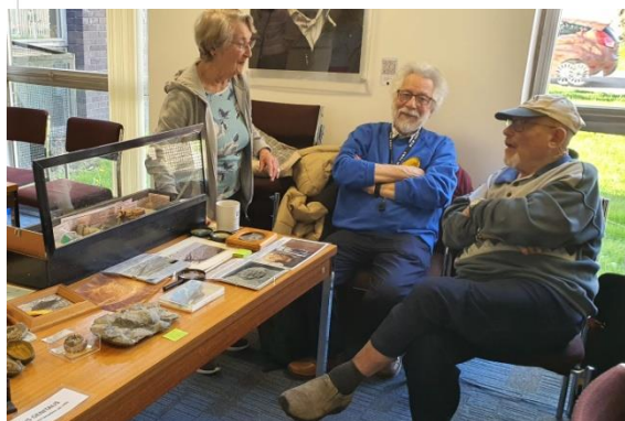
Social moments from the Fossils-themed Earth Discovery Session at Brunel University in April 2023.

A larger lecture room will be used for future sessions, the next one being ' Minerals ', in May, including spectacular minerals from members' collections, fluorescing minerals to explore with UV torches, industrial minerals, and fascinating tiny micromounts to examine.