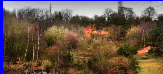
Shire Oak Quarry (Triassic)