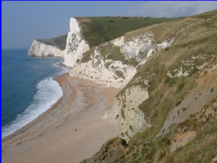
West from Durdle Door