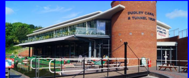
Dudley Canal & Tunnel Trust