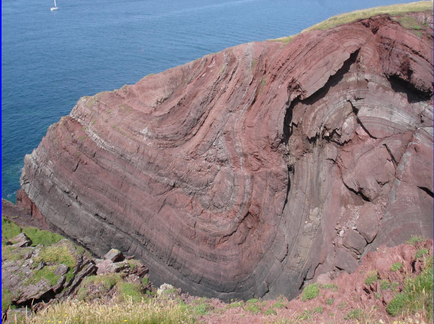
Old Red Sandstone, St Ann's Head, Pembrokeshire