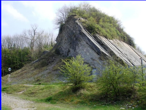
Wren's Nest (Silurian limestones)

We propose to include Wren's Nest, Saltwells, Limestone Mines boat Tour, Wolverhampton's glacial erratics, Blue Rock & Shire Oak Quarries + the Dudley Museum.