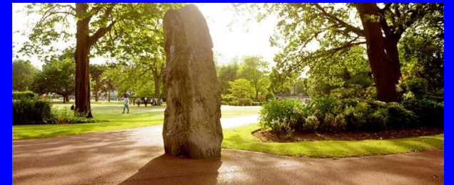
West Park, Wolverhampton