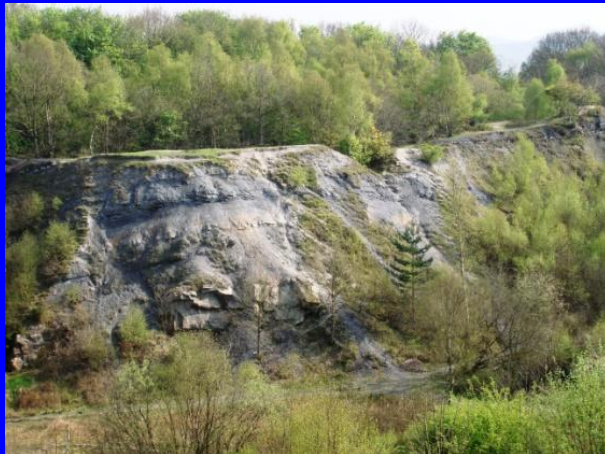
Saltwells (Coal Measures)