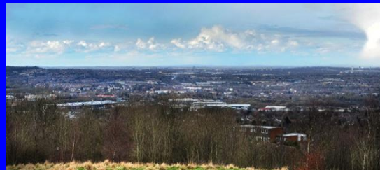
From Blue Rock Quarry (igneous)