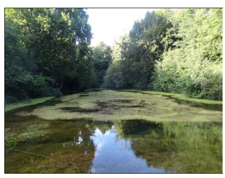
The Silent Pool (chalk spring fed)