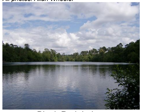
Black Park Lake

21-24 May (Sun-Wed). Suffolk. This trip will include visits to sites in the shallow marine Crag deposits of Pliocene and early Pleistocene age which outcrop in eastern Suffolk and Norfolk. These fossiliferous sandy deposits were laid down in the southern North Sea between c. 4 and 1.5 Ma, during fluctuating climatic conditions. Our February talk on Plio-Pleistocene climatic and environmental change in Eurasia will be relevant. It is hoped to include visits to Eocene sections and Pleistocene glacial and interglacial deposits; the exact itinerary is being researched. We will probably be based in the Ipswich or Felixstowe areas. Further details of potential sites here and here.