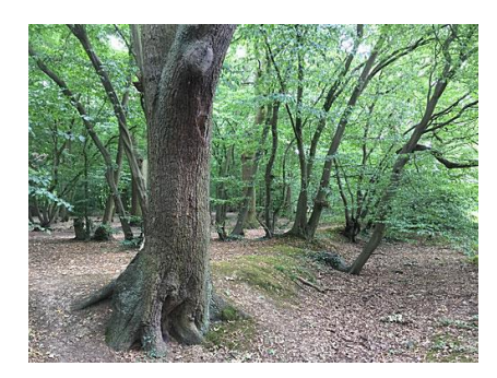
Coldfall Wood

Coldfall Wood (nearest station East Finchley, Northern Line, 1.3 km). This locality lies adjacent to an outcrop of glacial deposits from the Anglian Glaciation, the most extensive known on the present British mainland, reaching north London about 450,000 years ago. Underlying that is the Dollis Hill Gravel, age c. 800 ka, deposited by the Wey-Mole combined river, then a south bank tributary of the pre-diversion Thames. Both these deposits rest on London Clay. If time and energy permits, we could also visit Queens Wood, Highgate which is close to Highgate station.