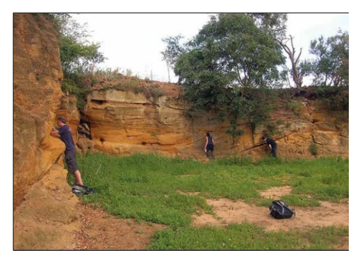
Coralline Crag, Sudbourne

21-24 May (Sun-Wed). Suffolk. This trip will include visits to sites in the shallow marine Crag deposits of Pliocene and early Pleistocene age which outcrop in eastern Suffolk and Norfolk. These fossiliferous sandy deposits were laid down in the southern North Sea between c. 4 and 1.5 Ma, during fluctuating climatic conditions. Our February talk on Plio-Pleistocene climatic and environmental change in Eurasia will be relevant. It is hoped to include visits to Eocene sections and Pleistocene glacial and interglacial deposits; the exact itinerary is being researched. We will probably be based in the Ipswich or Felixstowe areas. Further details of potential sites here and here.