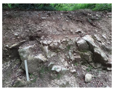
Seaford Chalk Formation