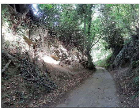
Sunken lane in Bargate Stone