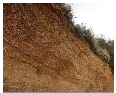
Red Crag, Bawdsey Cliff