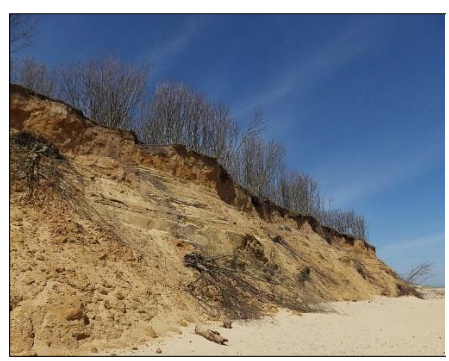
Norwich Crag, Covehithe